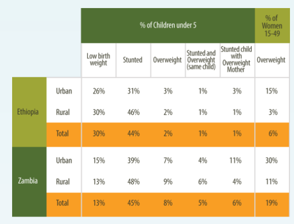
Table 1. Contrast of Ethiopia and Zambia, Regional Overweight Prevalence

Calculations from Ethiopia DHS (2011) and Zambia DHS (2007)