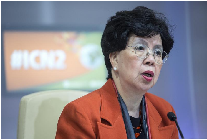
Margaret Chan, WHO DG

“The world's food system – with its reliance on industrialized production and globalized markets – produces ample supplies, but creates some problems for public health. Part of the world has too little to eat, leaving millions vulnerable to death or disease caused by nutrient deficiencies. Another part overeats, with widespread obesity pushing life-expectancy figures backwards and pushing the costs of health care to astronomical heights.”