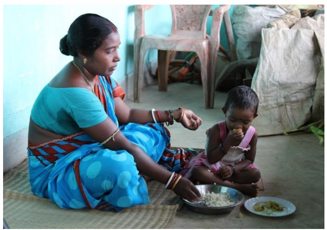
A mother in India sits closely encouraging her child to eat.

In India, the complementary feeding videos highlighted feeding young children patiently, not force-feeding, and encouraging the child to self-feed with finger foods, along with messages on food consistency and dietary diversity.