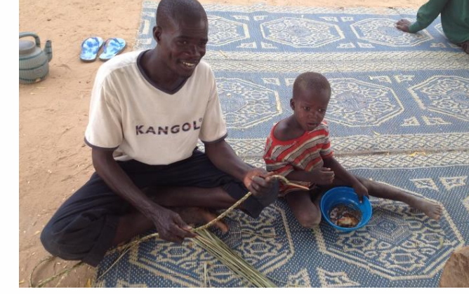
A father in Niger nurtures his child through play and responsive feeding

In Niger, the videos focused on promoting a responsive feeding style and using a separate plate, because formative research showed children ate from a family plate, with little interaction with a caregiver.