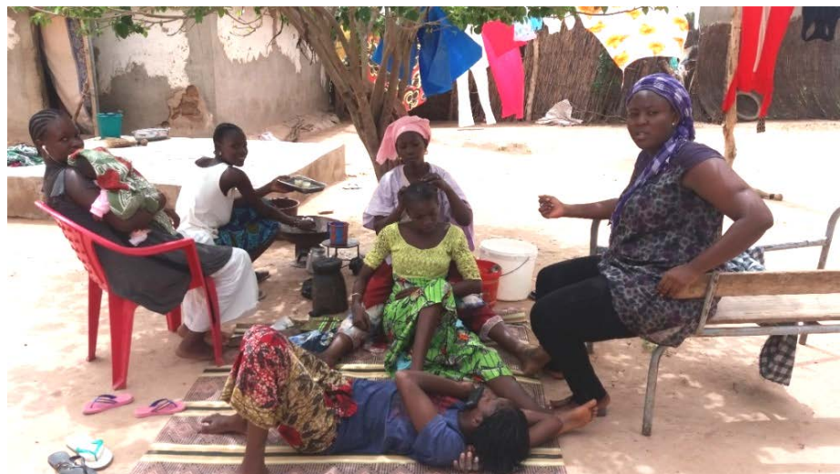
Household interview in Mbam Laghem village.