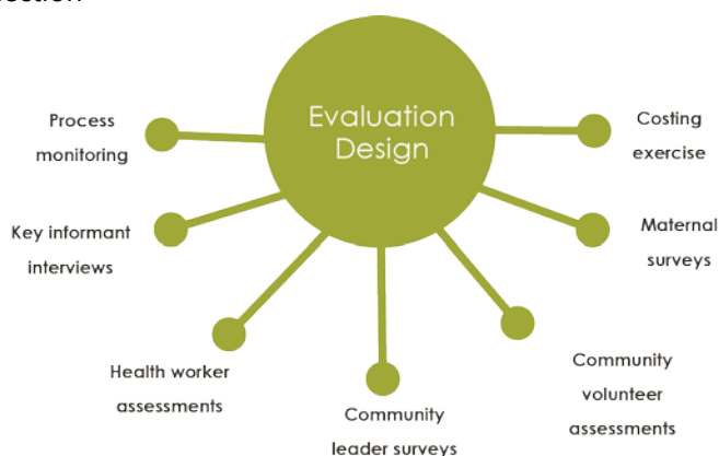
Figure 1. Data Collection Methods

Data collection procedures: Community volunteers completed a register for each support group conducted and then summarized all support groups and home visits conducted each month on the Community Volunteer Monthly Summary Form. This form was submitted to a nearby health facility every 1 to 2 months during monthly review meetings. Staff at ten of the C-IYCF health facilities aggregated what was reported by the community volunteers in their ward and submitted this summary to the LGA during the LGA-level monthly review meetings. The LGA then aggregated that which was reported by these health facilities. Figure 2 below depicts this flow of data.