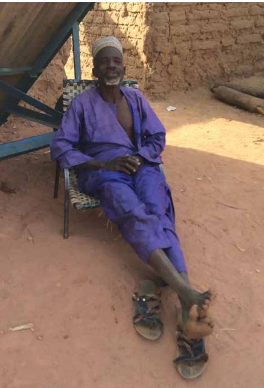
A father relaxes in Maradi, Niger, where community videos are helping couples increase their communication about household nutrition and hygiene.