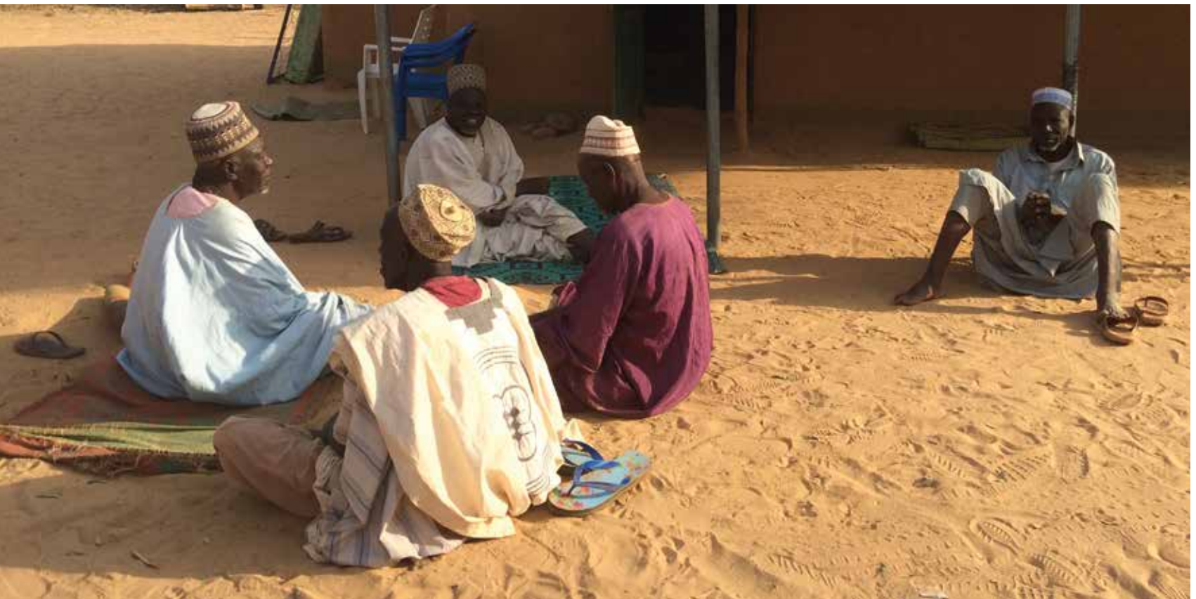
Men talk with each other in the village of Naki Karfi, where husbands were exposed to MIYCN messages through community videos and discussions with their wives.

We explored findings from the qualitative research across the three study objectives, which are summarized below.