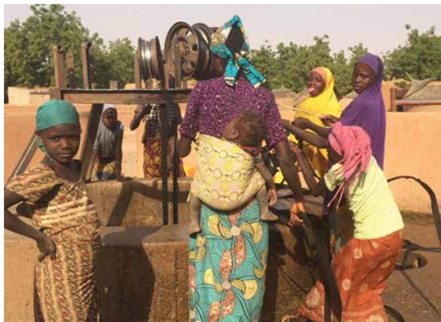
Women fetch water in the village in Dan Gado, where community videos on MIYCN encourage men to share responsibility for household chores and family nutrition.

Other respondents who saw the videos confirmed the importance of everyone seeing these videos, including people such as co-wives, mothers-in-law, and community members. A mother-in-law recommended that the videos be shown to the men instead of having the women relay the information to their husbands, so that the men could see what the women were trying to explain. The videos would catch the attention of the men, just as they had the women. One community member suggested that the videos should be shared with anyone who had not viewed them. He also requested that the video production team increase the number of topics covered by the videos.