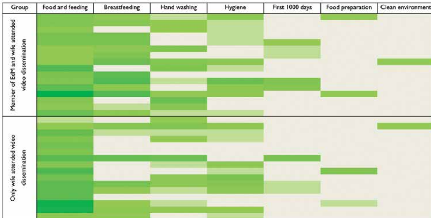
Figure 1. Heat Map of Common Maternal, Newborn, and Young Child Nutrition Topics That Husbands Learned About