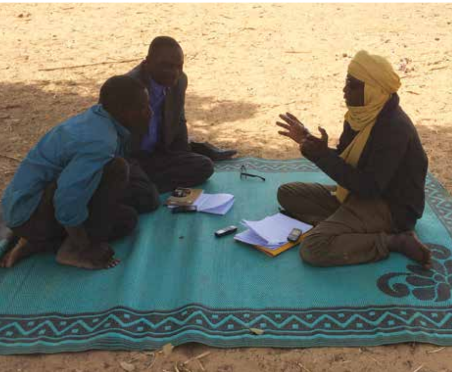
Members of the study team interview a father in Naki Karfi.