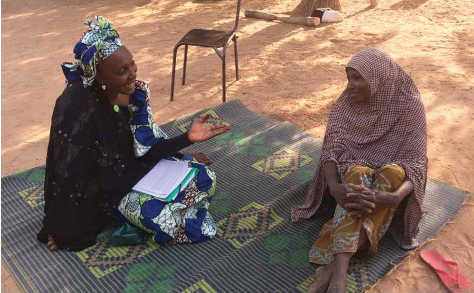
A study team member interviews a mother in Dan Gado.

example—and continue to disseminate new themes to increase their support. More research is needed to understand additional approaches that can be implemented to address these barriers. An approach that is more focused on community-based