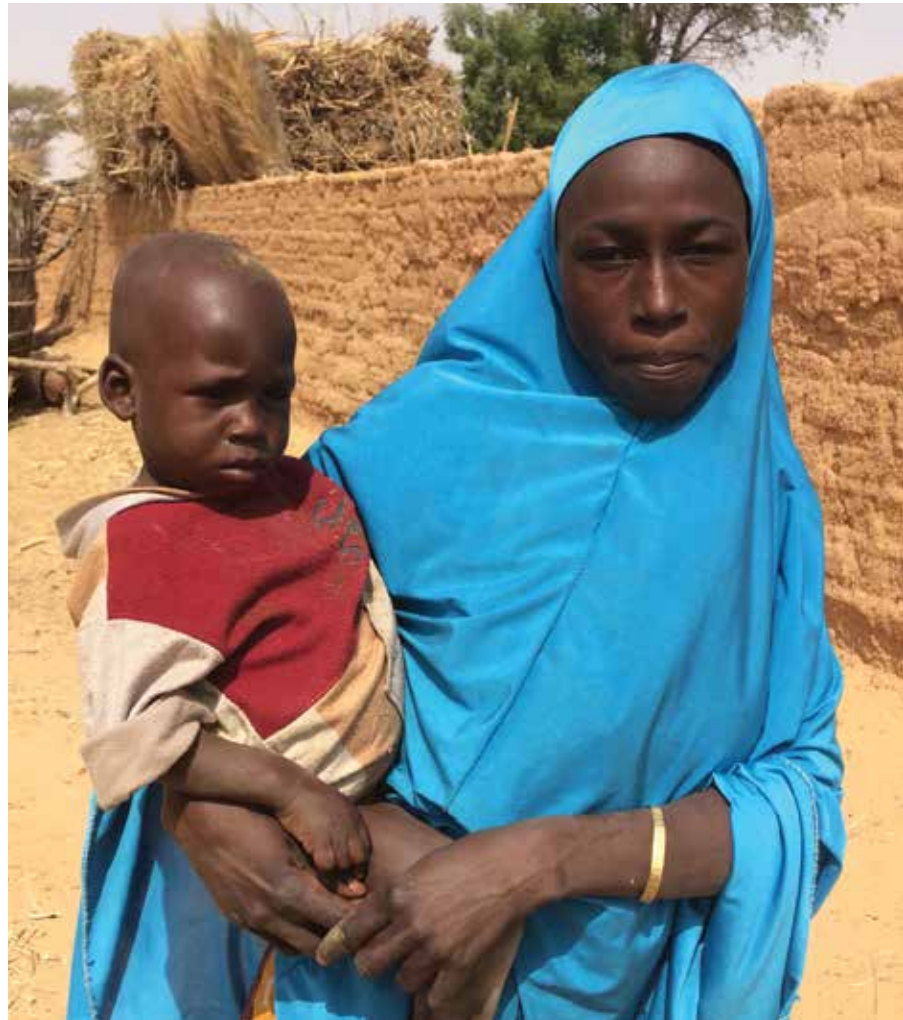
A mother holds her child in Niger’s Maradi region, where study teams conducted in-depth interviews with mothers from five villages.

Objective 3: To assess how community members and important influencers, such as mothers-in-law, perceive changes in spousal communication and husbands’ support for MIYCN behavior after exposure to the SPRING community video approach.